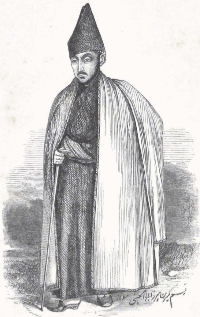
Haji Mirza Aghassi, Prime Minister of Persia under the late Mahmood Shah. From a drawing by a Persian Artist.