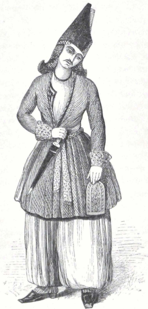
A PERSIAN GENTLEMAN. From a drawing by a Persian Artist